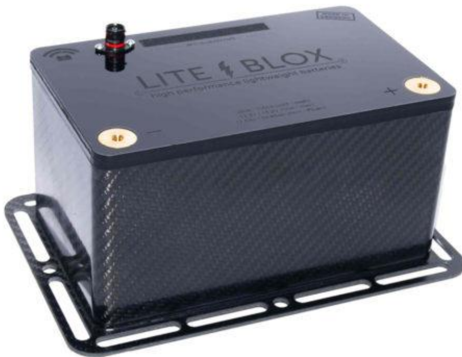
Figure similar to product: may contain special equipment

high performance accumulator - LiFePO4 / 13,2VDC / 231Wh -